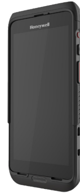
The CT47: Ultra-rugged 5G mobile computer on the Mobility Edge™ platform

The CT47 is enhanced for performance with a superior rugged design for any environment and is optimally balanced with durability and functionality in mind to keep business workflows moving and operations flowing. Combined with powerful software including Operational Intelligence, Smart Talk communications, Smart Pay, and more, the CT47 is the ideal choice for users in transport & logistics and warehouse.